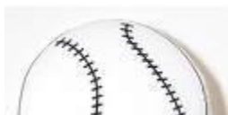
Half a baseball

Breakfast cereals Soups Mixed dishes (stew, chili) Medium Fruit